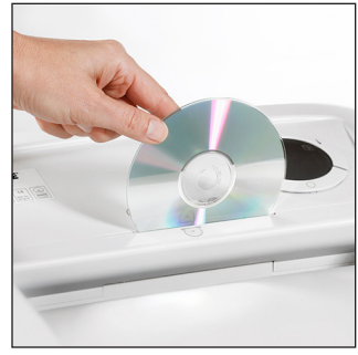
Dahle Professional shredder with built in user-friendly opening for CD/DVD destruction

Dahle's shredders are German Engineered using the latest technology and finest materials. The end result is a quality machine and peace of mind in knowing your Dahle shredder will provide many years of trouble free operation.